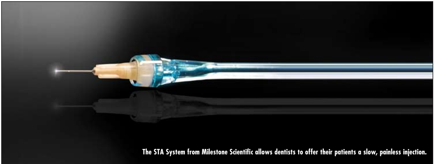
The STA System from Milestone Scientific allows dentists to offer their patients a slow, painless injection.

istered easily by a computer-controlled local anesthesia delivery system (STA™ System) manufactured by Milestone Scientific. The STA System addresses this problem precisely by controlling the flow rate of the injection so that the injection can be administered below the patient’s pain perception threshold. The technology is a feedback mechanism (dynamic pressure sensing) that tells the dentist in real time both visually and audibly whether he or she has placed the tip of the needle in the PDL space for a proper intraligamentary injection. The STA System also provides feedback that the needle has not moved during the injection, ensuring accuracy. This technique has the added advantage of profound anesthesia to a single tooth without causing numbness to the patient’s lips, tongue or the other teeth. This technique has made my love for endodontics even stronger.